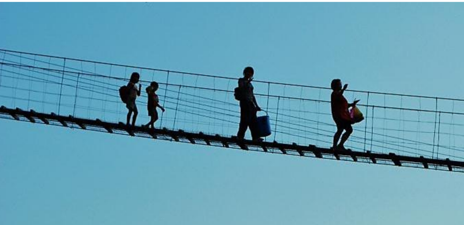
Dusun women and children in Ulu Papar, Sabah, Malaysia.

This report sets out the key findings of this body of research. Section 1 argues that the inadequacy of rights afforded to Indigenous peoples and local communities and the insufficient levels of legal and non-legal recognition and support for ICCAs in many countries actively undermine the integrity of ICCAs. Section 2 illustrates that there are many positive developments at the international and national levels. Section 3 highlights that, despite these developments, Indigenous peoples and local communities are still routinely denied their rights and ICCAs remain largely under-recognized and under-supported by state agencies and other key actors. Section 4 shows that many Indigenous peoples, local communities and their ICCAs are resilient to hostile legal systems, though may need support to flourish. Section 5 proposes a number of important recommendations for the 193 state Parties to the Convention on Biological Diversity, among others, about how to improve the legal and non-legal recognition of and support for ICCAs.