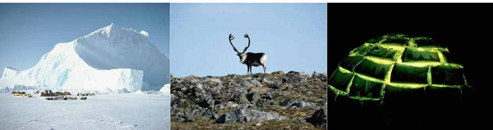
(Left to right) Hunting party with dogsleds; caribou; igloo (traditional homestead).

The Inuit of Nunavut have a comprehensive agreement with the Government of Canada . Nunavut is the largest, northernmost, and newest territory of Canada, officially separating from the Northwest Territories on 1 April, 1999 (via the Nunavut Act and the Nunavut Land Claims Agreement Act ). Being the dominant population in Nunavut, the Inuit of Nunavut have qualified opportunities to exercise customary law. For example, the Nunavut government requires the application of Inuit knowledge ( Qaujimajatuqangi ) for the governance of the environment in the territory.