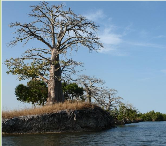
A centuries-old shell mound at Petit Kassa , Casamance, Senegal.

Senegal , like many countries in sub-Saharan Africa, has numerous small sacred forests and other sacred natural sites. However, they are not given any formal status under protected area legislation or other statutes and their protection is entirely dependent on local norms and customs.