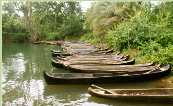
Guna boats, Panama.

The Constitution of the State of Panama ignores the rights of Indigenous peoples to their natural resources. According to the Constitution, the State has national sovereignty over all natural resources in the country. Subsequent laws stipulate that subsoil resources and forests are all property of the State, disregarding Indigenous peoples' rights to the same resources. This has triggered many conflicts and cases of loss of natural resources due to both legal and illegal exploitation.