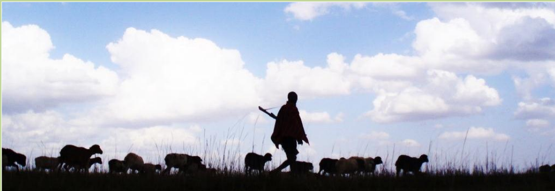
Samburu herder protecting his flock in northern Kenya.

constituted areas such as conservancies as well as traditionally protected areas such as pastoralist communities' customary grazing reserves. Nevertheless, the ultimate impact will depend on its implementation, which is inextricably linked to the country's broader political struggles.