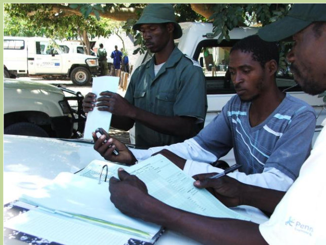
Community game guards download GPS data during the annual game count in the Mayuni Conservancy, North Eastern Namibia.

Article 96 of Panama's Wildlife Law (1998) states that the National Environmental Authority will coordinate all matters related to the environmental and natural resources in Indigenous peoples' territories with the traditional authorities of the relevant peoples and communities. The law also stipulates in Article 104 that when authorizing the use of natural resources in Comarcas or the lands of Indigenous peoples, projects presented by the members of the community will be preferred, provided they meet the conditions and procedures established by the competent authorities.