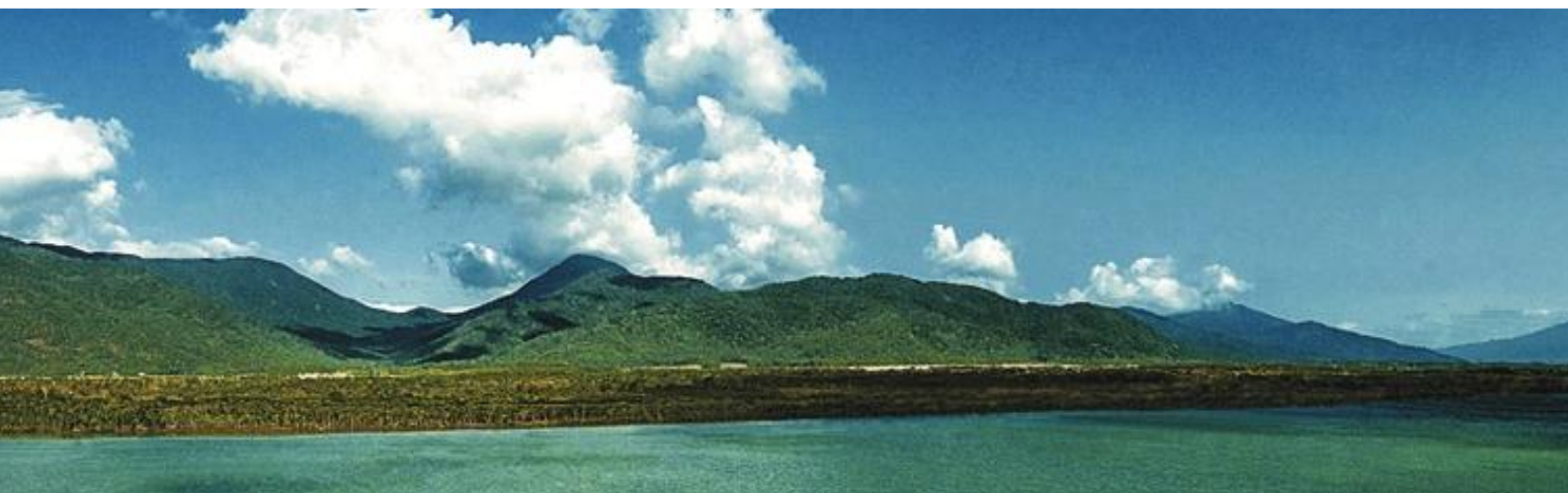
Trinity Inlet, Mandingalbay Yidinji Indigenous Protected Area, Queensland.

The first IPA to be based on Indigenous Country was dedicated by Mandingalbay Yidinji people over their traditional estate near Cairns in northeast Queensland in December 2011. The Mandingalbay Yidinji IPA includes all or part of the following government-declared conservation areas: national park, forest reserve, environmental reserve, terrestrial and marine world heritage areas, marine park, fish habitat area, and local government reserve. The IPA management plan provides the framework for the recognition of Mandingalbay Yidinji cultural rights, interests and values across all the tenures within the IPA. Dedication of the IPA has been recognized by each of the government agencies with legal responsibility for the management of the separate tenures within the IPA and collaboration occurs through an implementation committee chaired by a representative of Mandingalbay Yidinji people.