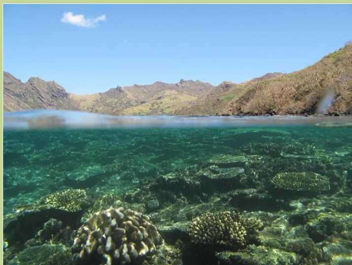
A ridge-to-reef seascape from Waya Island, Fiji.

In terms of current legislation, the Fijian i Taukei Lands Act provides in Section 3 that 'native lands shall be held by native Fijians according to native custom as evidenced by usage and tradition.' This provision allows for a broad spectrum of usage and governance rights defined by native custom and tradition, as well as being subject to the regulations made by the iTaukei Affairs Board. Section 21 of the Forest Decree gives provision for the customary rights of native Fijians on native land and the right to exercise any rights established by native custom such as hunting, fishing or collecting wild fruits and vegetables. According to Section 13 of the Fisheries Act , it is an offence to fish or collect shellfish without a permit for trade or sale in an area