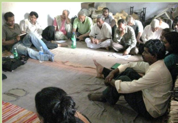
Members of the federation of community conserved areas in Nayagarh district, Orissa (India), meeting to discuss the 2006 Forest Rights Act.

In India , for instance, the Forest Rights Act has seen very inadequate use by communities to claim rights to and governance of forests. There are several reasons for this, including lack of awareness about the Act or how to make claims; lack of proactive assistance from government departments; deliberate obstruction by some government agencies or officials; difficulties in finding evidence to file with the claims; and superimposition of top-down boundaries related to government schemes rather than acceptance of customary boundaries of the community.