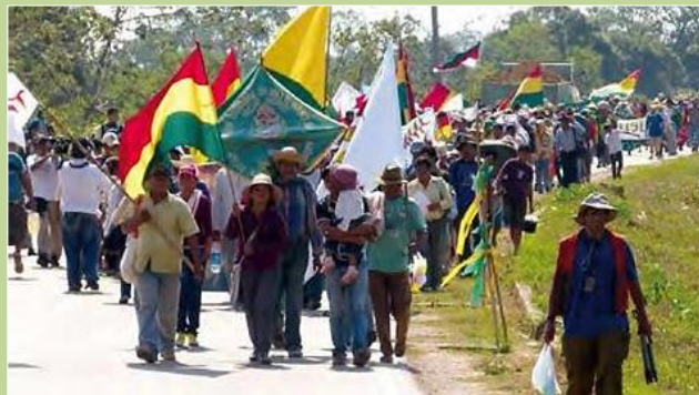
The IX Indigenous peoples' march against the construction of the road through the TIPNIS, in their rise to the Andes (Bolivia).

However, the Bolivian Government has combined the discourse of defending the rights of Mother Earth and the need for a 'buen vivir' (good life) in harmony with nature with an aggressive economic policy that prioritizes the exploitation of fossil fuels, minerals and other natural resources. The promotion of mega-projects within the framework of the regional infrastructure initiative of South America (IIRSA, in Spanish), mines, biofuel production, soy expansion, and hydro-electric dams has been accompanied by increasing porosity of environmental regulations and a large number of social conflicts. The well-known conflict over the proposed road through the TIPNIS (Isiboro Sécore National Park and Indigenous Territory) is but one example.