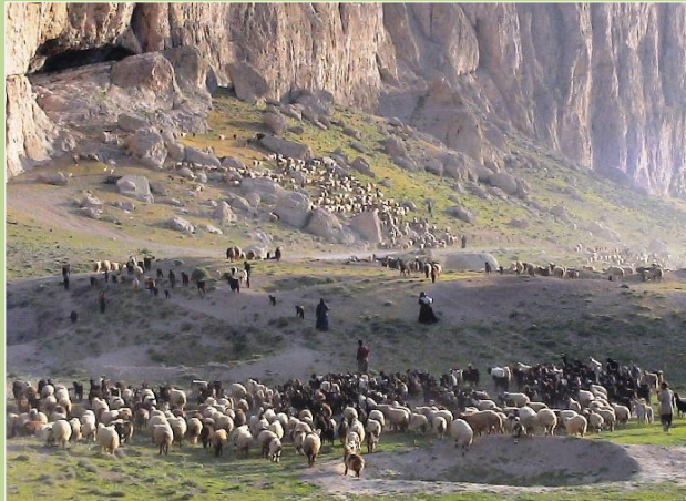
The biodiversity-rich rangelands of the Qashqai tribal territory.

In Iran , government organizations such as the Department of the Environment (DOE) and the Forests, Rangelands and Watershed Organization are members of the National Steering Committee of the UNDP-Global Environment Facility Small Grants Programme (GEF-SGP) and have lent their support and approval to relevant GEF-SGP projects focusing on ICCAs. In July 2007, the director general of the DOE stated that: “The DOE is responsible for adding 200,000 hectares to the country’s protected areas before 2020. We should use lessons learned from the pilot projects in support of ICCAs in Iran and see how they can facilitate the process for more support and recognition of the ICCAs by approving suitable policies and laws in this regard.”