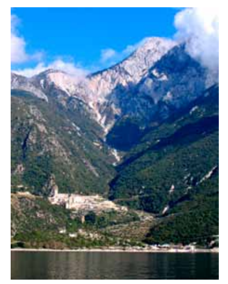
The only self governed monastic state of the world, Athos (now within Greece), stronghold of the ancient Byzantine Orthodox tradition for over ten centuries, and conserves some of the best coastal and forest Mediterranean ecosystems

protected areas including monastic communities may have very diverse ownership and governance systems concerning boards, planning, management, public use, etc. With