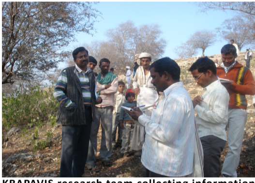
KRAPAVIS research team collecting information on ethnoveterinary herbs

Part of the work done by KRAPAVIS is focused on water conservation within the Orans and surrounding areas. This is imperative due to the serious reliance of local people on the water sources found in Orans, both for their livestock and themselves. This maintenance is realised through the use of water harvesting structures and checks for soil erosion.