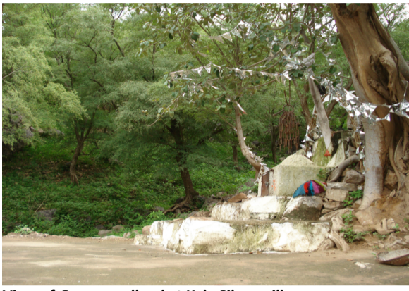
View of Oran woodland at Kala Sikara village