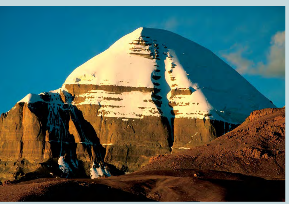
FIGURE 2 Mount Kailas, Tibet.

Deity or Abode of Deity. The power of many sacred mountains derives from the presence of deities—in, on, or as the mountain itself. Indians regard the graceful peak of Nanda Devi, a World Heritage site, as the abode of Nanda Devi, the Goddess of Bliss. A temple at the hill station of Almora has a well-known image of the deity. Native Hawaiians revere Kilauea itself as the body the volcano goddess Pele.