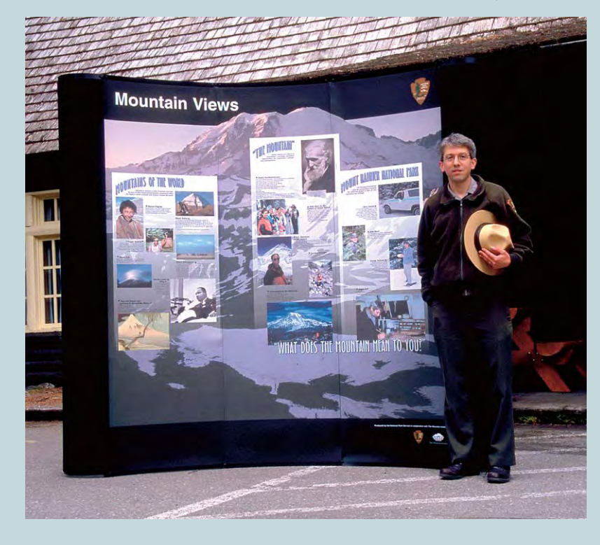
FIGURE 3 Mount Rainier traveling exhibit.

The exhibit has 3 sections: "The Mountain," "Mount Rainier National Park," and "Mountains of the World." Each section employs images of people