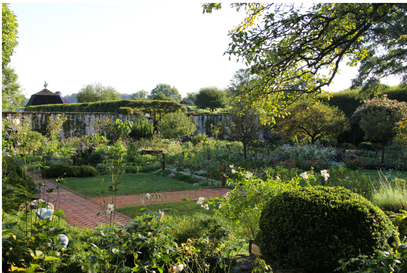
Fig. A2 Morning Garden. Oak Spring Garden Foundation, Upperville, Virginia.