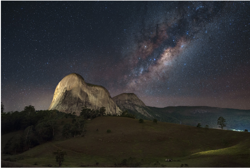
Fig. 9 Pedra Azul Milky Way.