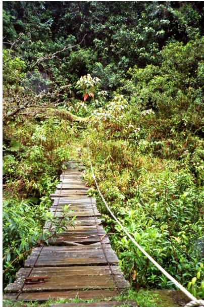
Fig. 4 Suspension Bridge in Cloud Forest Near Mindo, Ecuador.