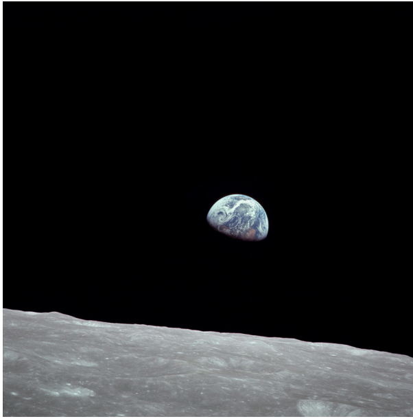
Fig. 1 Earthrise.

world: logical, poetic, verbal, emotional, perceptual, intellectual, social, and more.