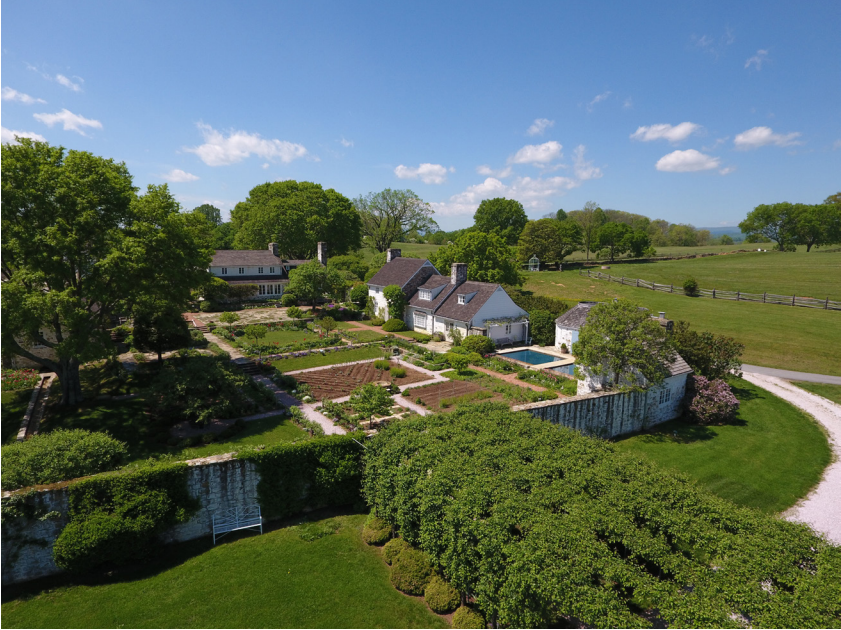
Fig. A1 Garden Aerial. Oak Springs Garden Foundation House, Upperville, Virginia.