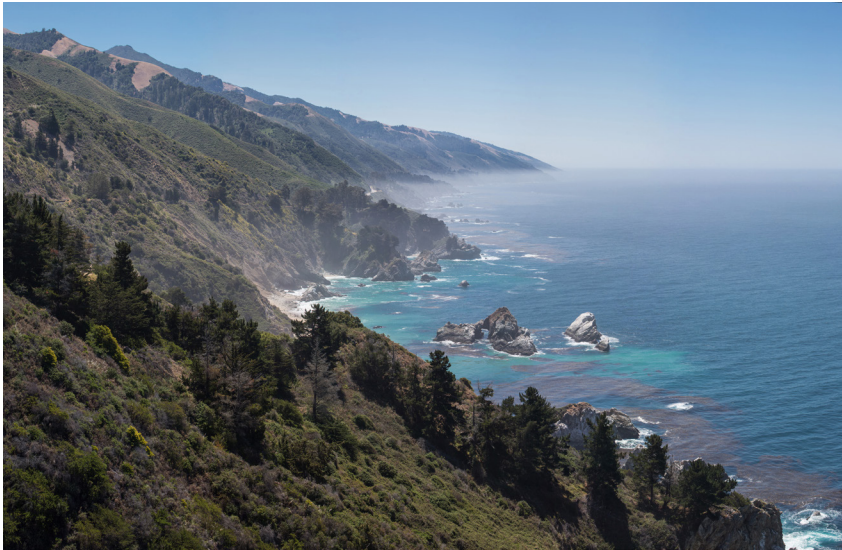
Fig. 6 Central Californian Coastline, Big Sur.