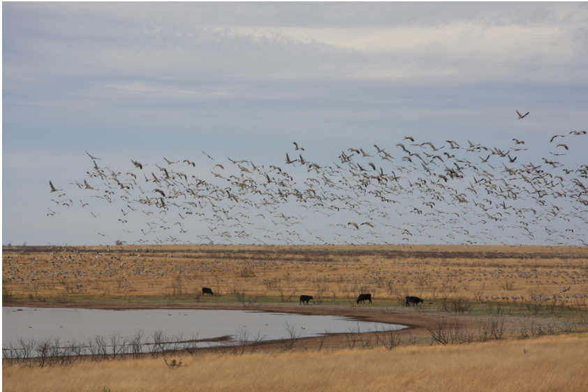
Fig. 2 Sandhill Crane in Flight, near Muleshoe National Wildlife Refuge, Bailey County, Texas.