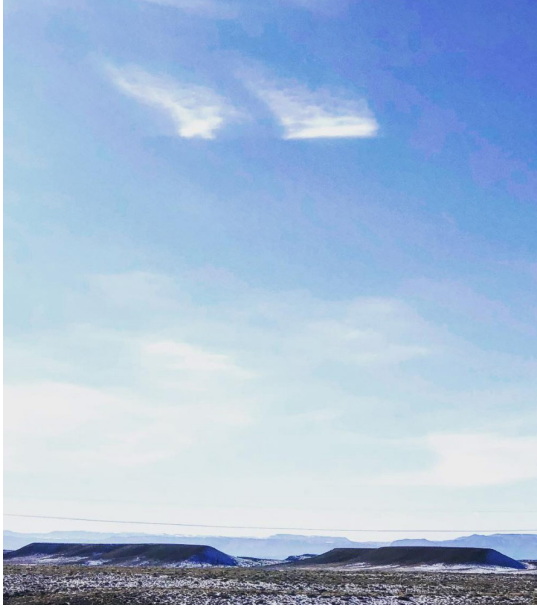
Fig. 7 Unnamed Buttes South of Wellington, Utah. Photo by Terry Tempest Williams (2019).

before falling into the perfect hole. The sound the ball makes as it drops into the hole — that is what I mean by ‘register’ or ‘resonate’).