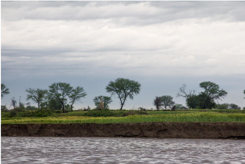
Fig.5 Yamuna River, near the Himalayas.