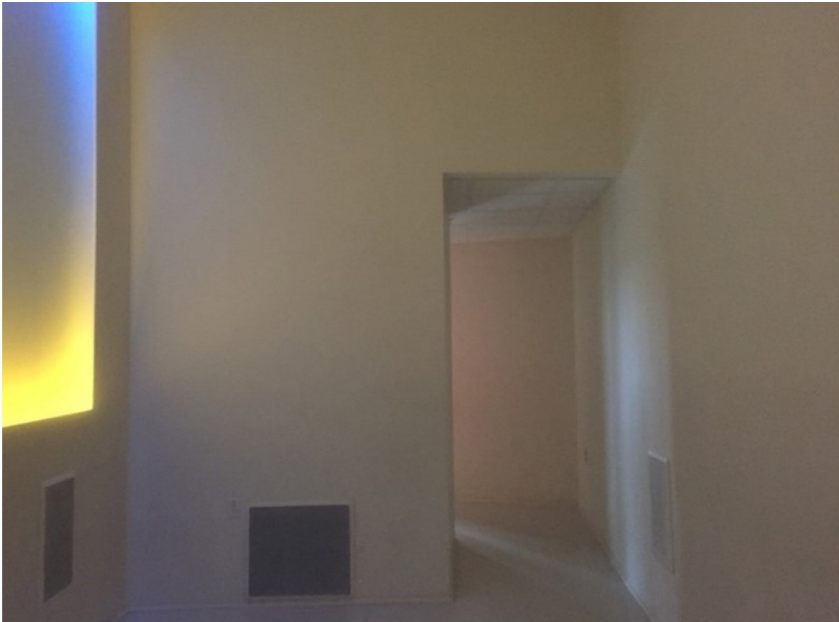
Fig. 3.3 ‘The Place’, Museum of the North, University of Alaska, Fairbanks, Alaska.

At the same time, what does the complex voice want to tug out of me — that perhaps I should give in to?