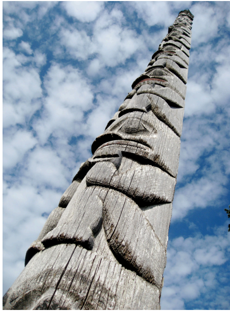
Fig. 8 Totemic Sentry, Prince Rupert, British Columbia, Canada.