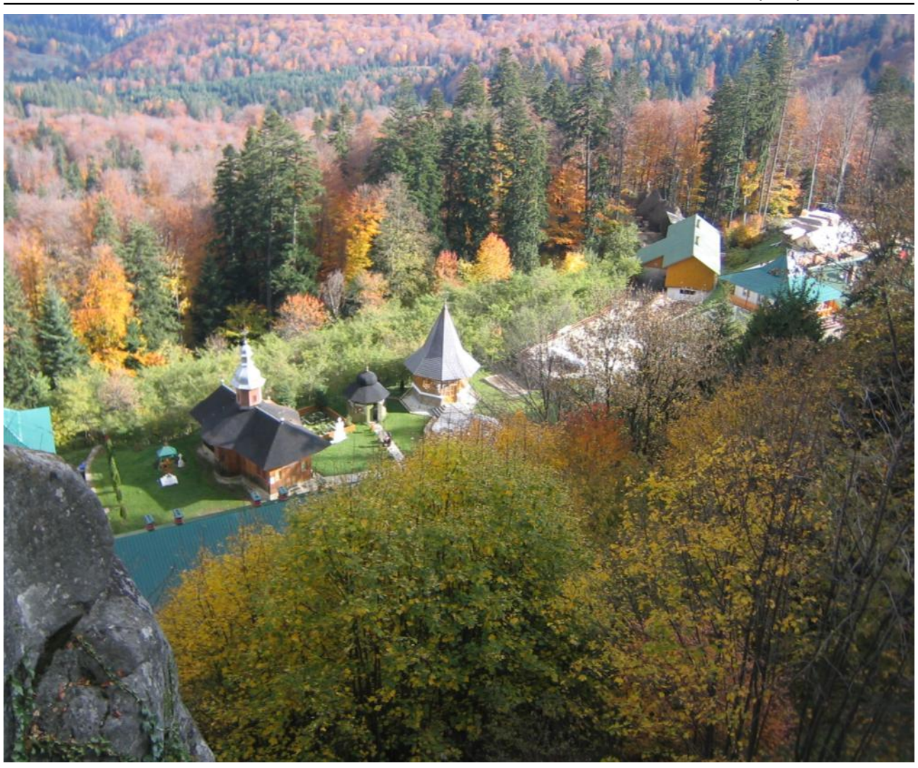
New Skete of Sihla, Moldavia, Romania, is a good example of the new orthodox monastic settlement in the Carpathians, within the Natural Park of Vanatori Neamt

the terms 'holy' or 'sacred' to refer to their territories. As these communities normally intend 'to endure for ever' in the same place, natural resources are carefully safeguarded not just for the present generation, but to be bestowed on future generations of monks or nuns. Among the most cherished values stemming from this philosophy are silence, solitude, harmony and beauty, which they consider as prerequisites for experiencing a sacred atmosphere (Mallarach & Papayannis, 2007). Here one finds all the criteria suggested by E. F. Schumacher to ensure the conservation of the intrinsic value of the land, namely health, beauty and permanence (Schumacher, 1997).