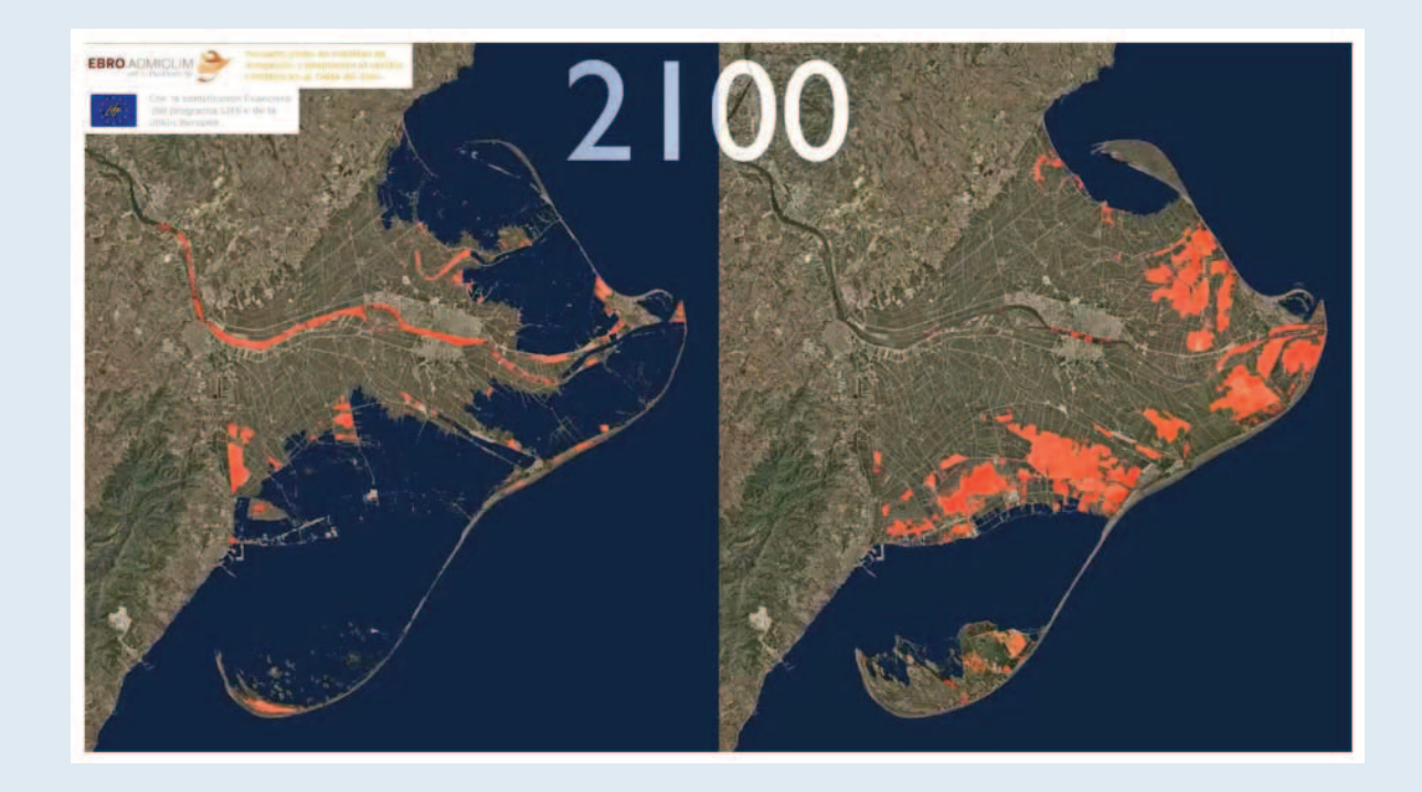
Figure 2. Scenarios of the Ebro Delta in 2100. On the left, delta evolution with the current contribution of sediments (practically nil). On the right, delta evolution with the planned contribution of sediments (model elaborated by Proyecto Life Ebro, https://www.lifeebroadmiclim.eu/, accessed 20 May 2024).